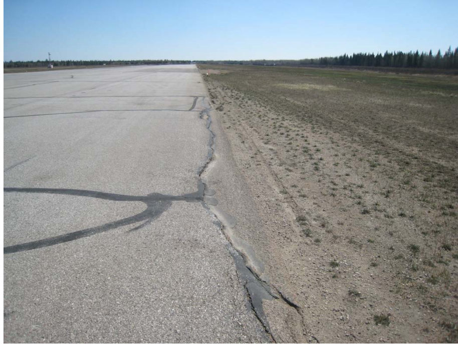
Figure 7: Pavement failure over the existing subdrain system and depression in the shoulder on Runway 14-32 [LU, 2015]