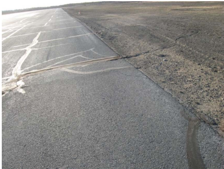
Figure 2: Severe settlements in the non-keel zone on Runway 10-28 and deep depressions on the shoulder [LU, May 2015]