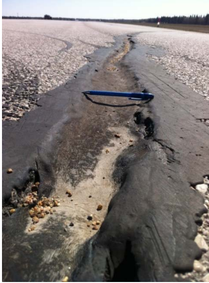
Figure 5: Severe transverse crack on Runway 14-32 [LU, 2015]