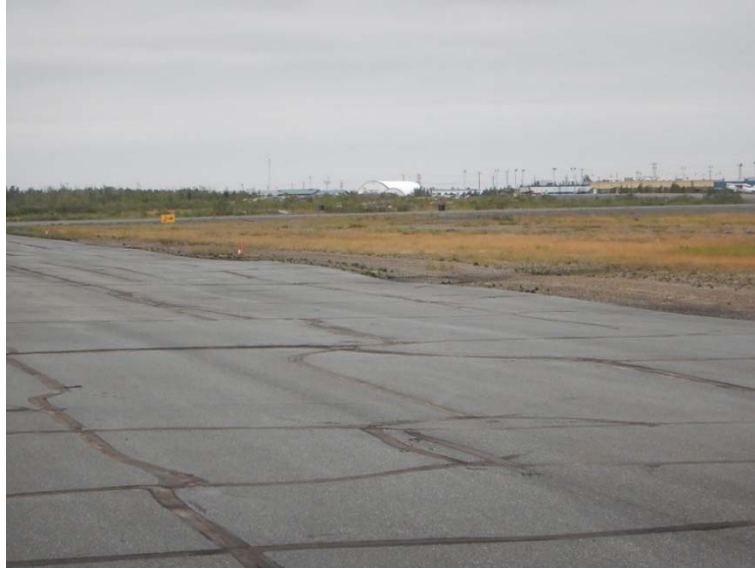
Figure 1: Severe pavement settlements and longitudinal and transverse cracking in the non-keel zone on Runway 10-28 [GNWT, 2014]