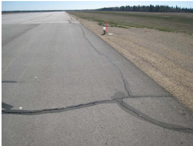
Figure 6: Settlements in the non-keel zone on Runway 14-32 and depressions on the shoulder [LU, May 2015]