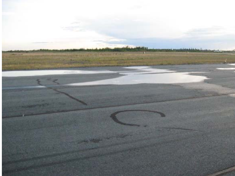
Figure 3: Water ponding in a deep pavement depression Runway 10-28 [GNWT, 2014]