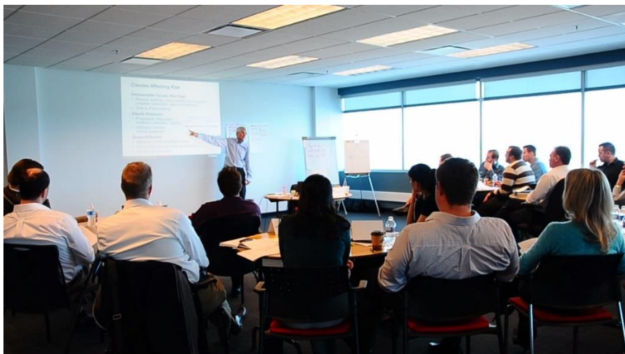
Figure 5 – Calgary Boot Camp Delivery

Before 2011, the PM training program did what it was designed to do: it allowed Stantec to show that its Project Managers (PM) were receiving training on the PM Framework. With the introduction of the PM Boot Camps, Brian Guthrie completely revamped the PM training program to offer an enriched environment where the adult learner could thrive.