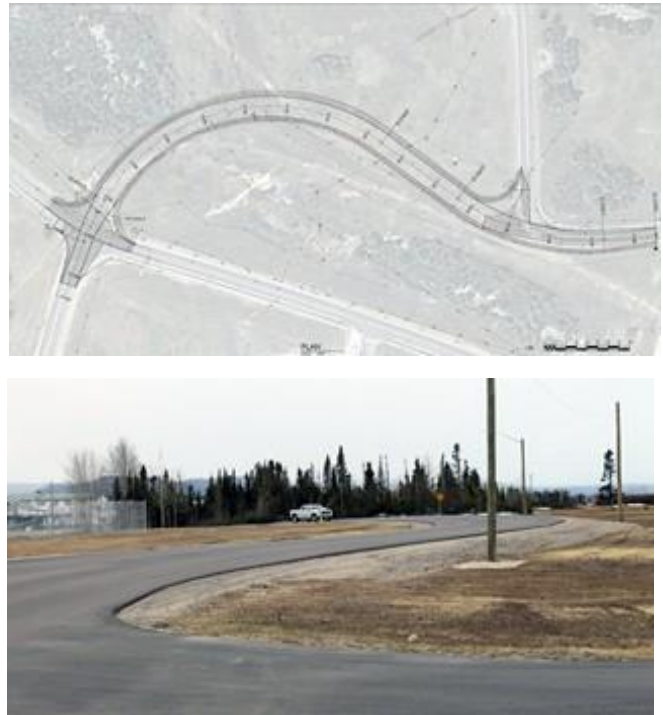
Figure 8 CFB Goose Bay, Vulcan Road Extension

Our Project Managers (PMs) live in the communities where they work, and every Stantec employee has a personal interest in improving the lives of their neighbours with safe, sustainable design. Every PM who participates in a Stantec PM Boot Camp is a community member who cares deeply about the lives they affect with their work. The PMs in our Transportation sector know that the transit systems, roads, terminals and bridges they design today will carry their friends and family to work, school, and play. The ultimate value of Stantec's PM Boot Camps to the Canadian transportation community is improved project quality and design for transportation systems across Canada, including our traffic systems, roads, bridges, transit systems and airports.