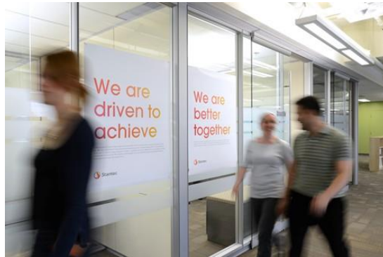
Figure 1 – Stantec's Core Values

Part of our commitment to do what is right relates to how we carry out our project work. Stantec's Project Management (PM) Framework was first developed in the mid-1980s. Our firm, then known as Stanley Engineering, was in the early stages of bidding for the first of several contracts to manage the extension of the Edmonton LRT. One of our VPs saw the need to introduce project management protocols in order to succeed in a project of this size; it was this readiness to innovate that won us the work and sparked the development of our quality management framework.