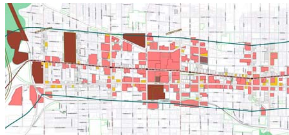
Figure 4: Downtown Parcel Sizes

The City also established a Corporate Working Team, which consists of staff from all City Departments to help identify risks and rewards of LRT to all City activities. This has allowed the team to identify operations, maintenance and capital improvements that should be considered early in the process to ensure that they are properly designed into the system and that surprises are minimized as the project develops.