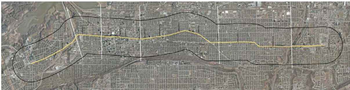
Figure 2: B-Line Land Use Planning Study Area

In addition to analysis of intensification opportunities, land use planning for the corridor is focused on the principles of transit oriented development, specifically planning for appropriate density and mixed uses, in proximity to transit stops to create unique, pedestrian oriented streets and public spaces. These elements form a critical role in re-establishing the corridor as a focus of activity for the many neighbourhoods adjacent to the corridor. The integration of the corridor with the neighbourhoods and ensuring connectivity to the corridor is a fundamental principle for corridor revitalization.