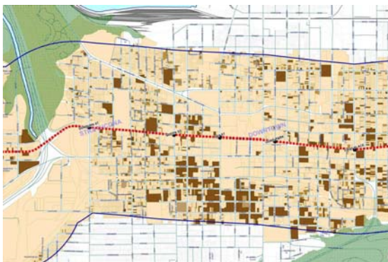
Figure 3: Downtown Residential Densities