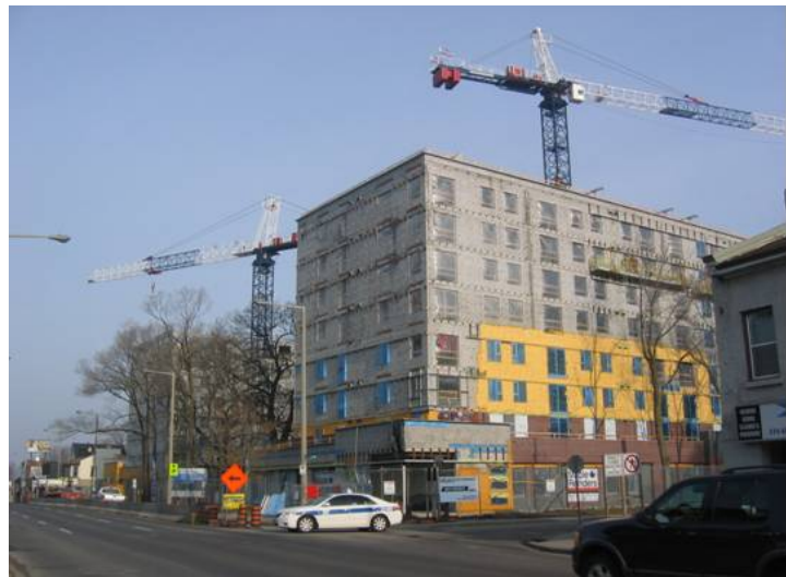
Figure 7: Example of Intensification on King Street West

How will LRT in Hamilton achieve its goals of growth, revitalization, intensification, etc. and what actions are required to maximize the chances of securing the benefits?