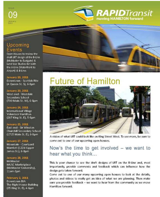
Figure 8: Rapid Transit Newsletter

Overall, the project team has been following a broad approach to stakeholder consultation and are adaptable of new communications trends to ensure that the project remains a point of discussion within the community, as the planning progresses.