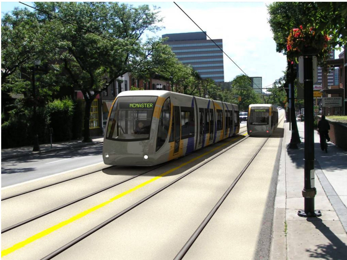
Figure 5: King Street West Light Rail Transit Rendering