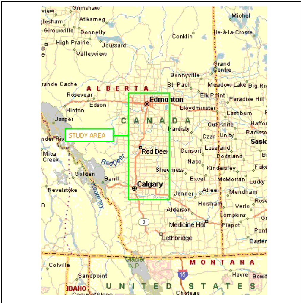
Exhibit 1 – Highway 2 Edmonton to Calgary Study Area