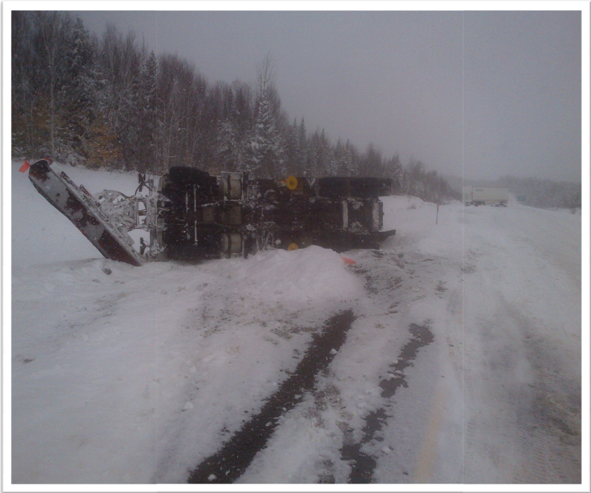
Figure 2 Result of a severe impact between a transport truck and the right wing of a snow plow truck in March 2013