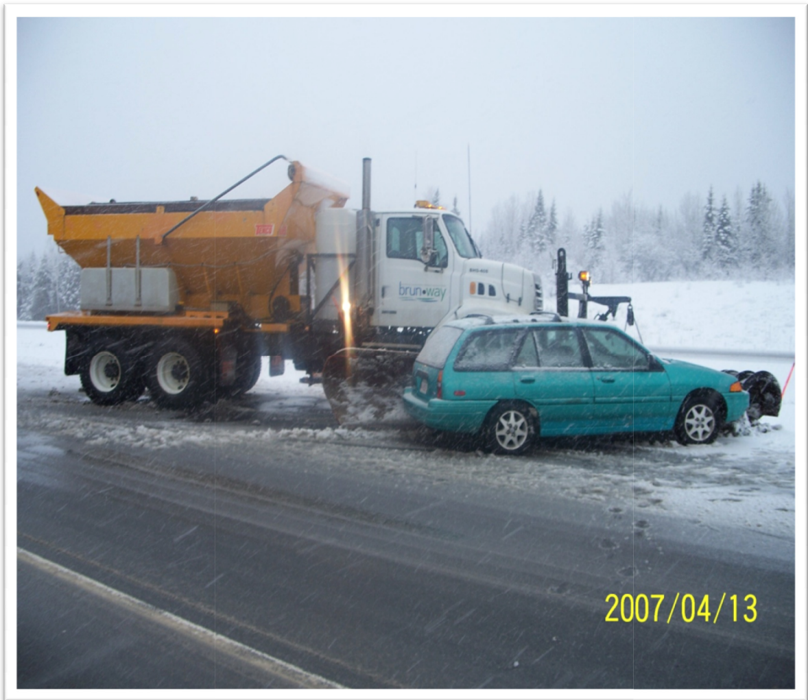
Figure 3 Impact between a small vehicle and the right wing plow