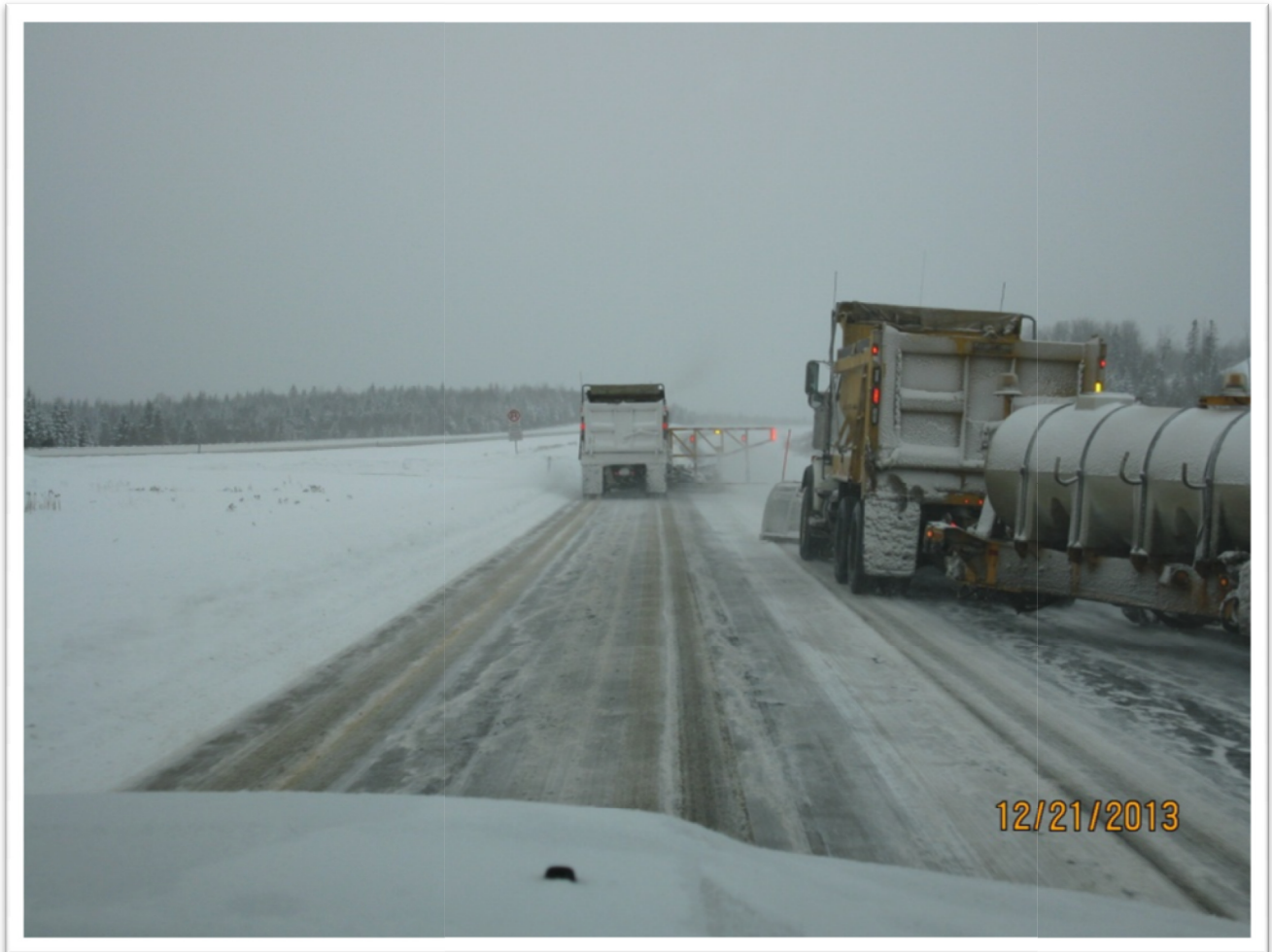
Figure 6 Lead plow (left) with deployed Safety Swing Arm.