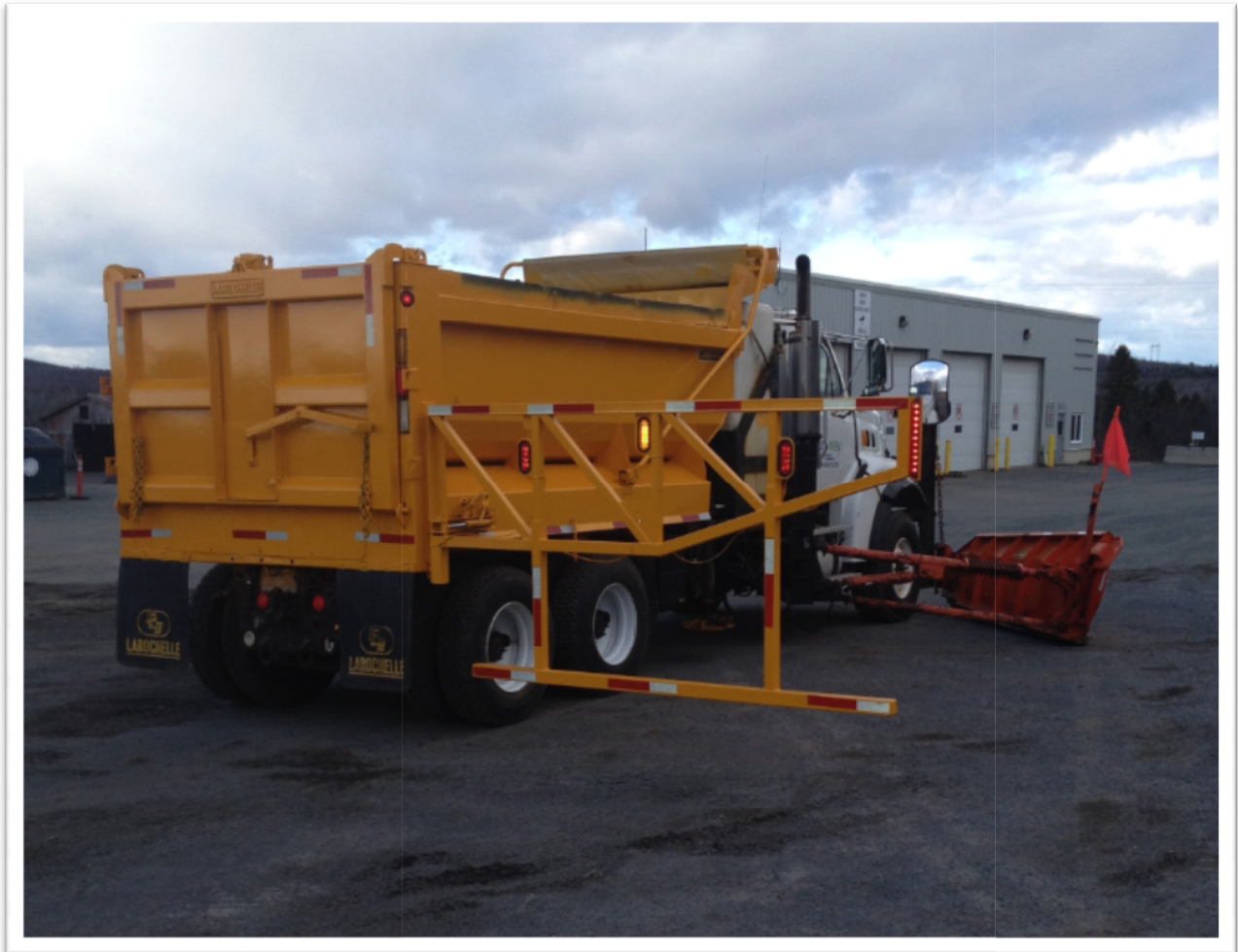
Figure 4 Safety Swing Arm deployed (2 nd version, 3.0 meter in length)