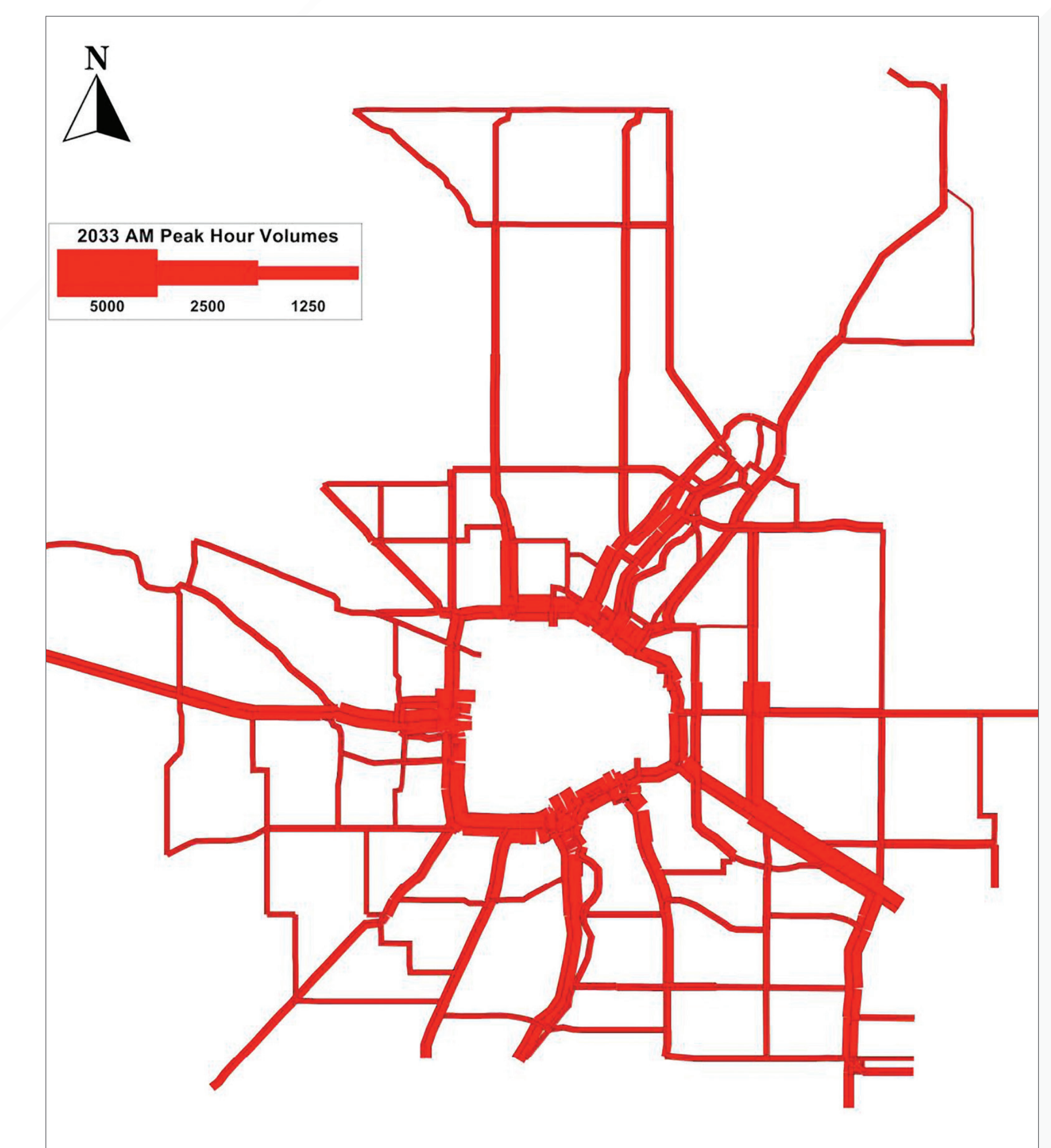
2033 AM Peak Hour - No Improvements