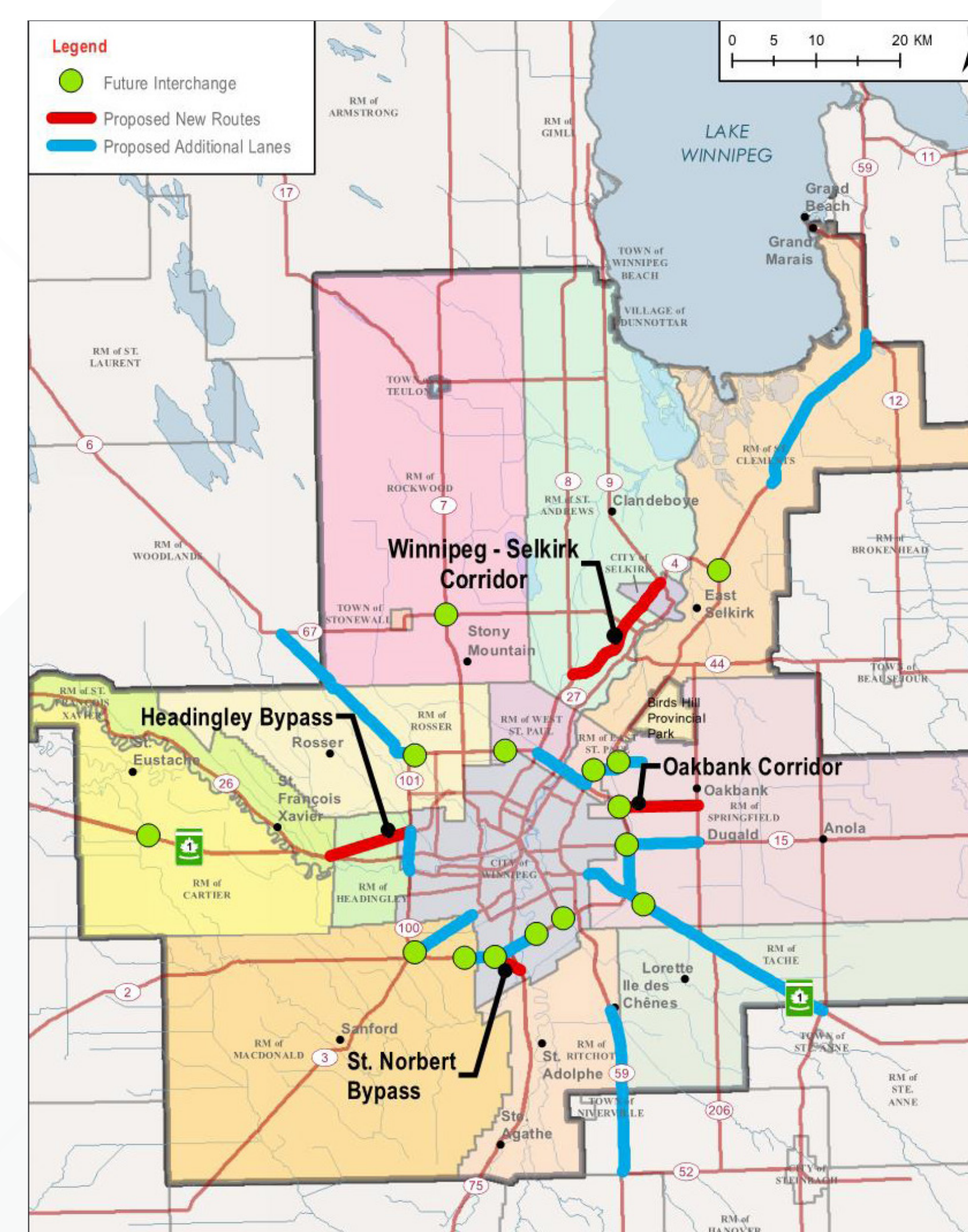
Future Highway Improvements