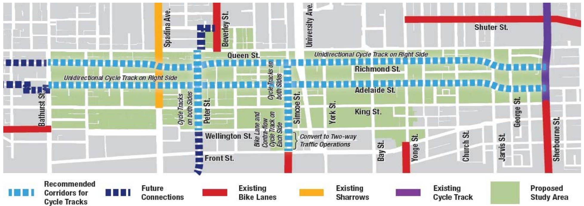
FIGURE 5 Cycling Infrastructure