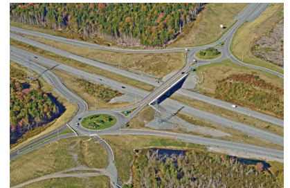
Highway 101, Margeson Road Interchange, Nova Scotia

A modern roundabout, herein referred to as a roundabout, is a type of circular intersection in which vehicles travel counter-clockwise (in Canada and other right-hand traffic rule of the road countries) around a central island, and can contain multiple lanes. Vehicles entering the roundabout must yield to circulating traffic. Roundabouts have specific geometric design