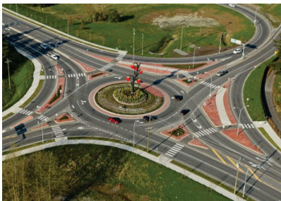
Clearbrook, British Columbia