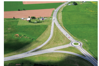
Travellers Rest, Prince Edward Island