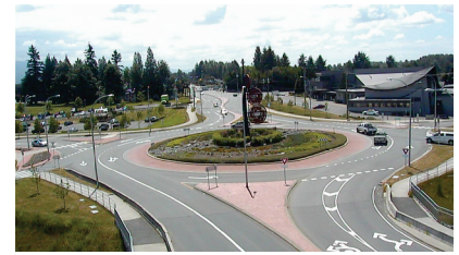
McCallum Road, Abbotsford, British Columbia

Transportation Association of Canada 2323 St. Laurent Blvd., Ottawa, ON K1G 4J8 Tel. (613) 736-1350 Fax (613) 736-1395 www.tac-atc.ca