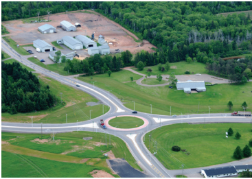
Pooles Corner, Prince Edward Island