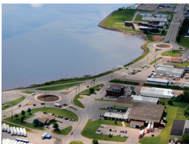
Riverside Drive, Prince Edward Island

In Canada, the first roundabouts did not emerge until the 1990’s. Although it is difficult to estimate the total number of roundabouts currently installed in Canada, this form of intersection control is becoming increasingly more common across the country.