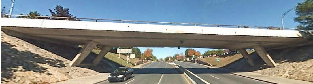
Figure 1: Illustration of the surveyed concrete bridge.