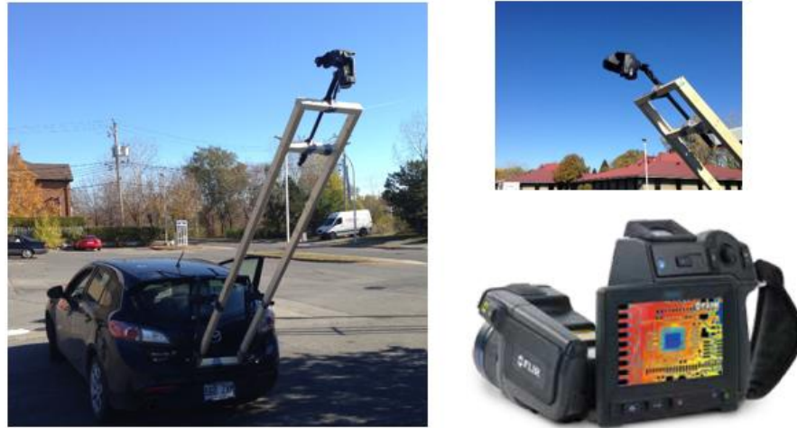
Figure 2: Illustration of the FLIR T650sc IR camera and vehicle mounted setup system.

to separate patches and surface defects from subsurface anomalies. Figure 2 illustrates the utilized camera and the vehicle mounted setup to survey the bridge deck.