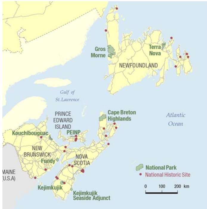
Figure 1 National Parks in Atlantic Canada