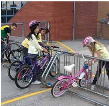
Students using bicycle racks sponsored by the City of Hamilton