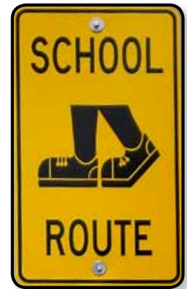
School Walking Route signage piloted in Mississauga, Brampton & other Ontario communities

Overall, administrators recognized the importance of school travel planning, but acknowledged that it still faces many 'roadblocks' such as: a lack of active transportation infrastructure in the community like sidewalks and bicycle lanes, and the need to ensure sufficient 'buy-in' to active travel and integration into the culture of a school, so that efforts will continue even if a key champion leaves the school.