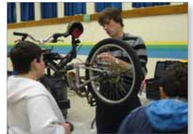
Students and their families take part in a bicycle repair workshop, Hamilton

"The project has improved the students' awareness and their efforts to walk to school."