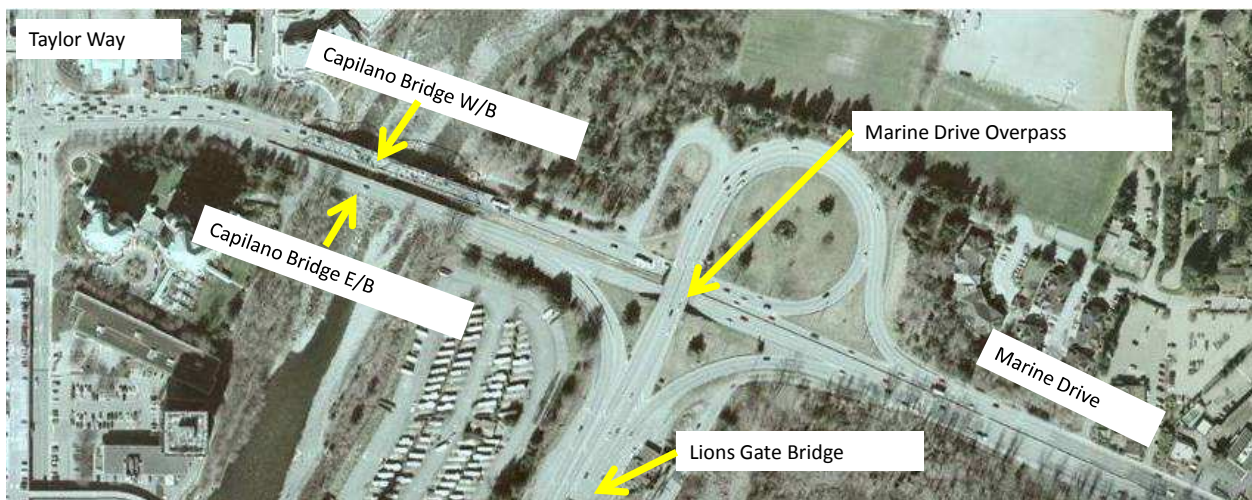
Figure 2: Overall Project Plan