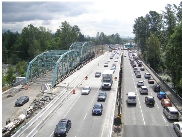
Figure 13: New Capilano River Bridge

Figure 13 shows the new Capilano River Bridge, with two of its lanes in service. Next to it is the old bridge in its detour position, now closed and being demolished.