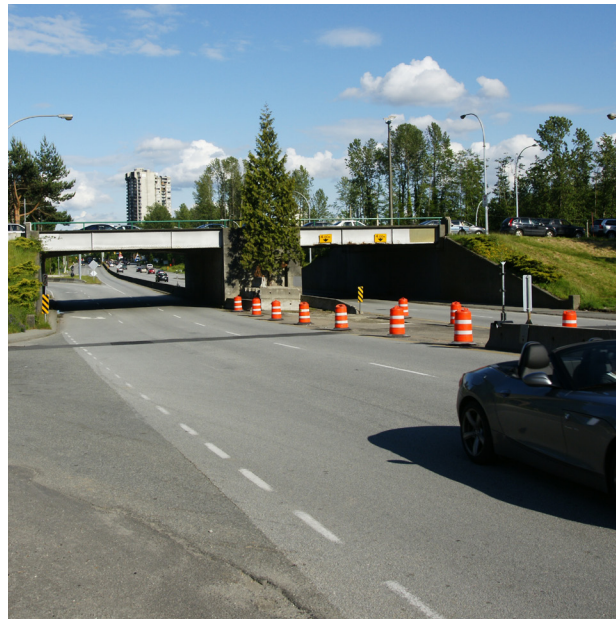
Figure 5: Existing Marine Drive Overpass

The existing overpass, prior to being replaced, is shown in Figure 5.