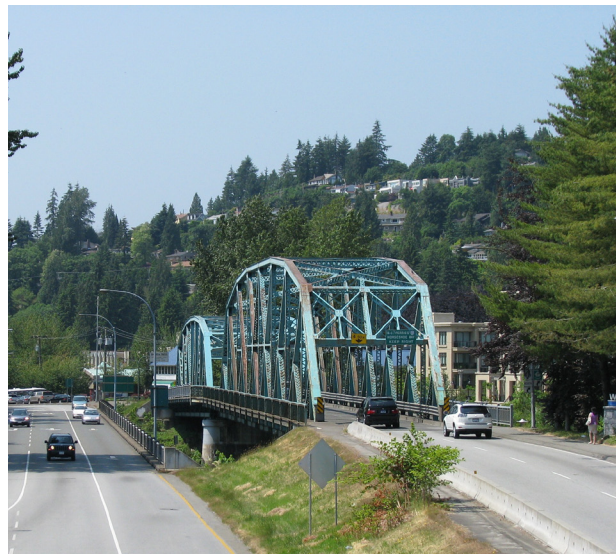
Figure 3: Existing Bridge Prior to Moving

The east 76m (250') steel truss span was constructed in 1929, along with a short approach span at each end, after a concrete arch bridge at that location was destroyed by flooding. The west 55m (180') span was added