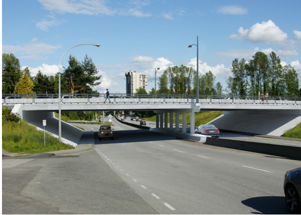
Figure 6: New Marine Drive Overpass