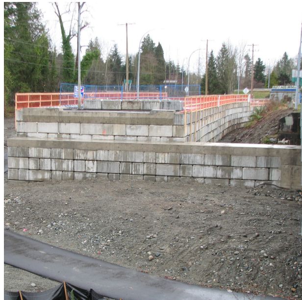
Figure 8: Temporary Abutment for Detour

Figure 8 shows one of the temporary abutments constructed in advance of the tendered bridge project, complete with the sliding runway connecting to the existing substructure.