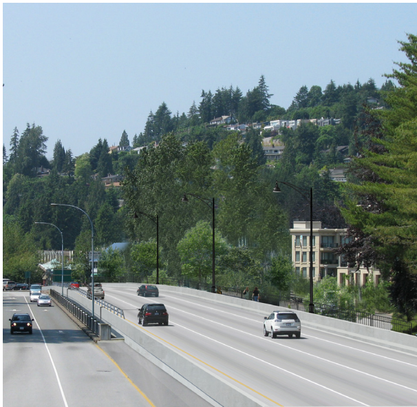
Figure 4: New Capilano River Bridge

A rendering of the new crossing is shown in Figure 4.