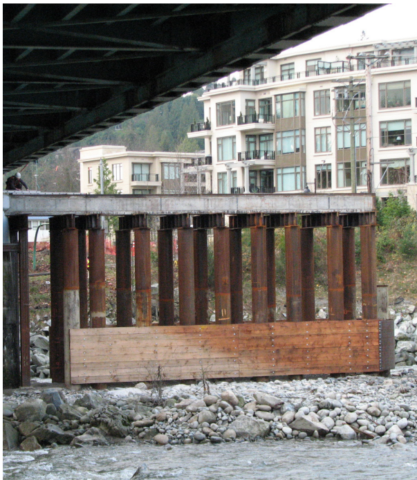
Figure 7: Temporary Pier for Detour

Figure 7 shows the temporary pier that was constructed in advance of the tendered bridge project.