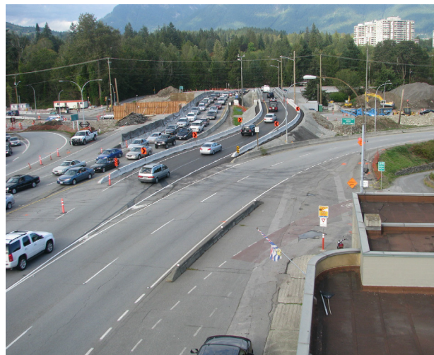
Figure 11: New Overpass Halfway Built

Figure 11 shows the overpass at the half-built stage of construction, with the detour bridge still in place at the right of the photo.