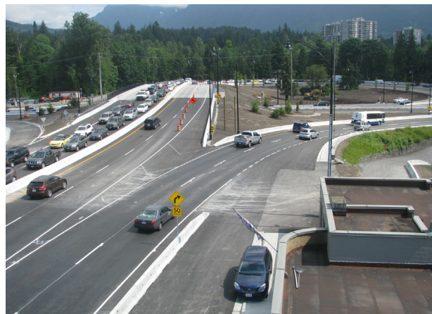
Figure 12: New Overpass Completed

Figure 12 shows the new overpass upon completion.