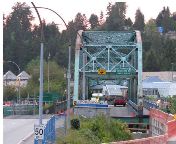
Figure 9: Bridge Partway Through the Move

Figure 9 shows the bridge partway through the move .