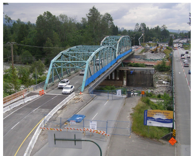
Figure 10: Bridge at Completion of the Move

Figure 10 shows the bridge at the completion of the move .