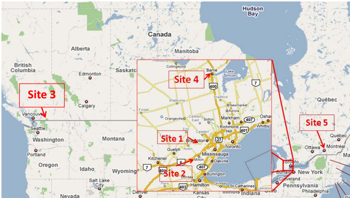
Figure 1: Field site locations

Each field site presented a unique scenario to evaluate various aspects of pervious concrete. More specifically, each site evaluates various aspects including: mix design; pavement structure; application; traffic; maintenance; and climate. Table 1 summaries of the field site features and experimental design aspects, including the key climatic attributes (Henderson, 2012).