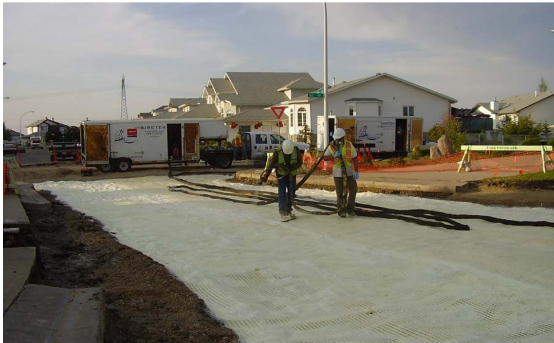
Figure 10 Uretek