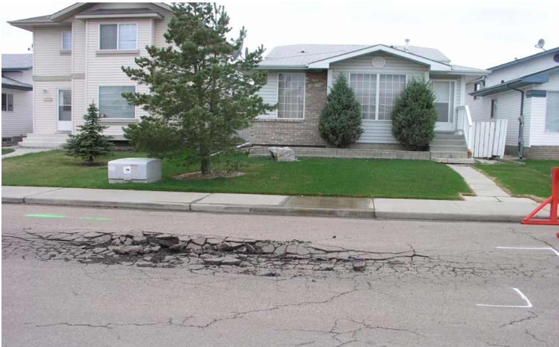
Figure 3 Structural Failure