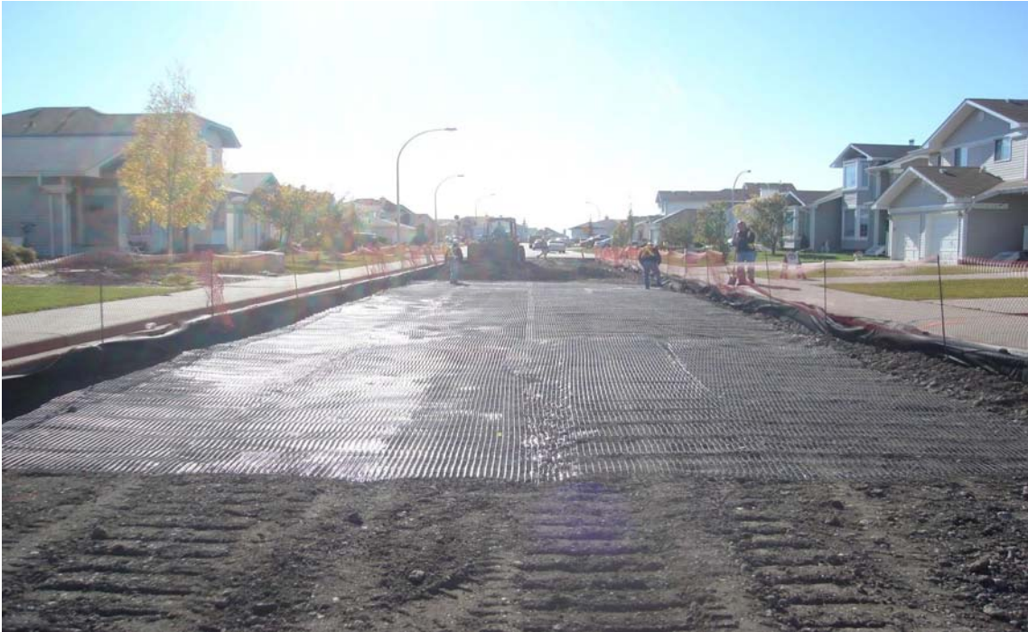
Figure 15 Geogrid Placement