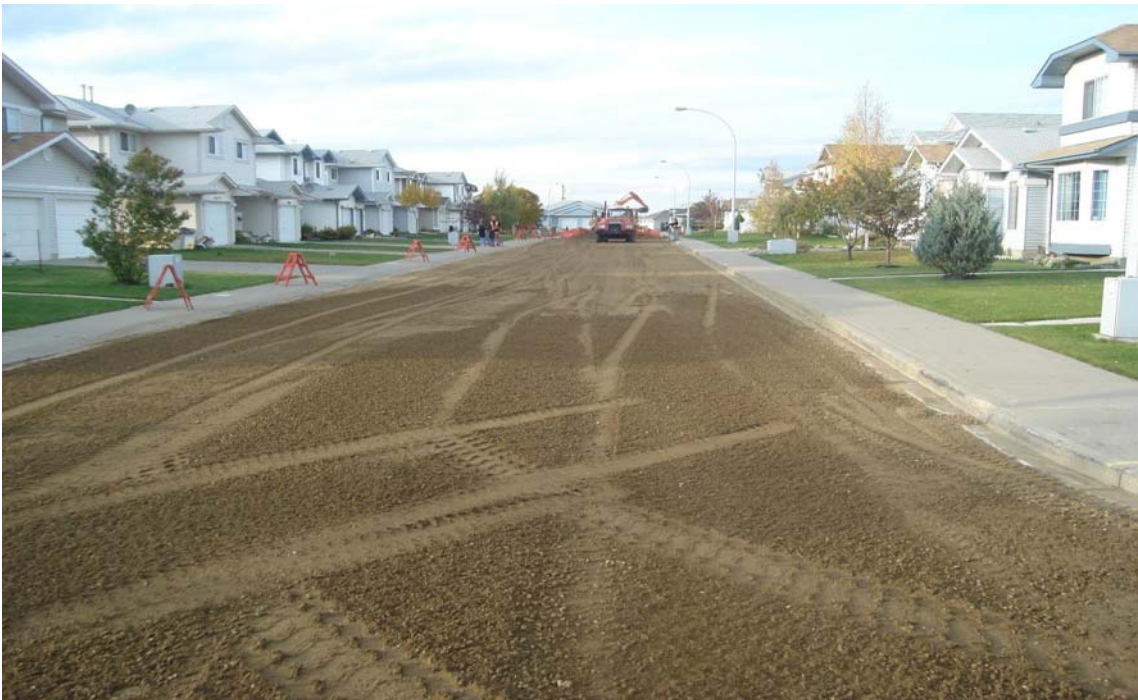
Figure 16 Placing 3-20 Granular Base