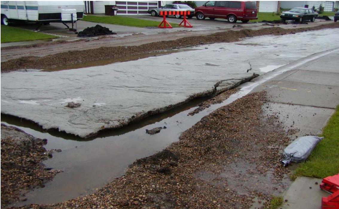
Figure 7 Cematrix Floating after Rainfall