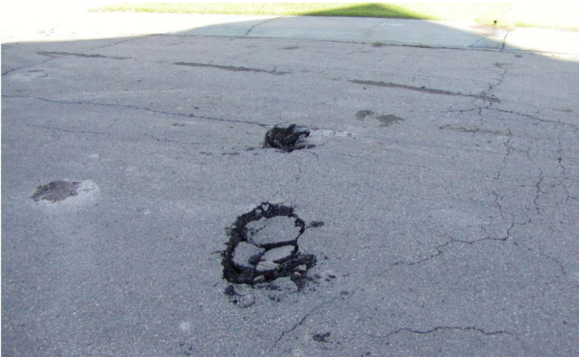
Figure 5 Failures due to soft subgrade