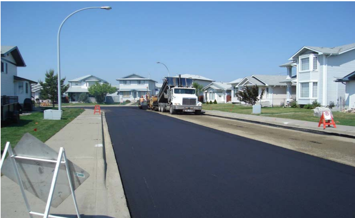
Figure 18 Paving