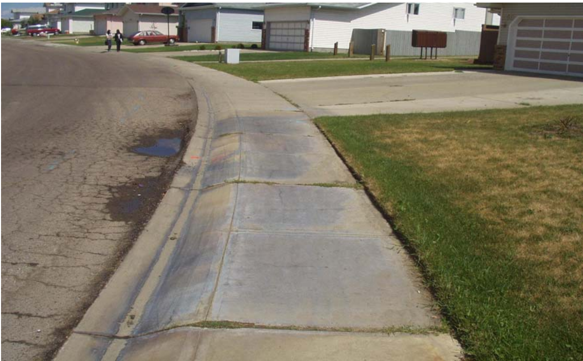
Figure 4 Water staining on sidewalk and alligator cracking on roadway.