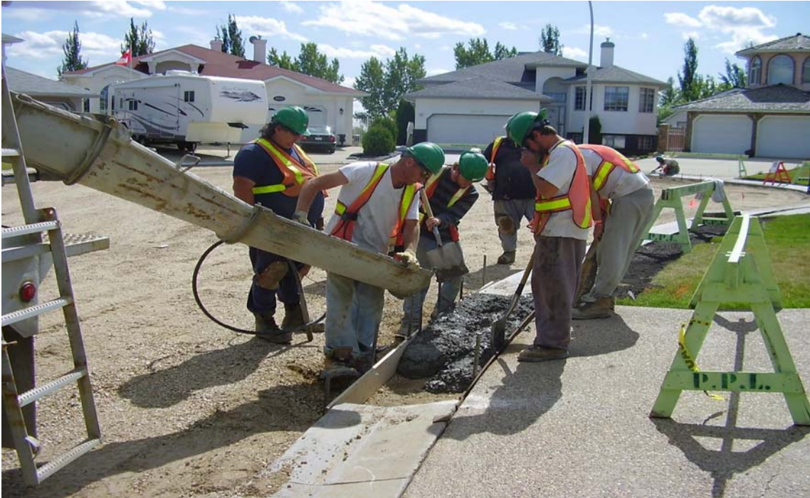
Figure 17 Concrete Replacement