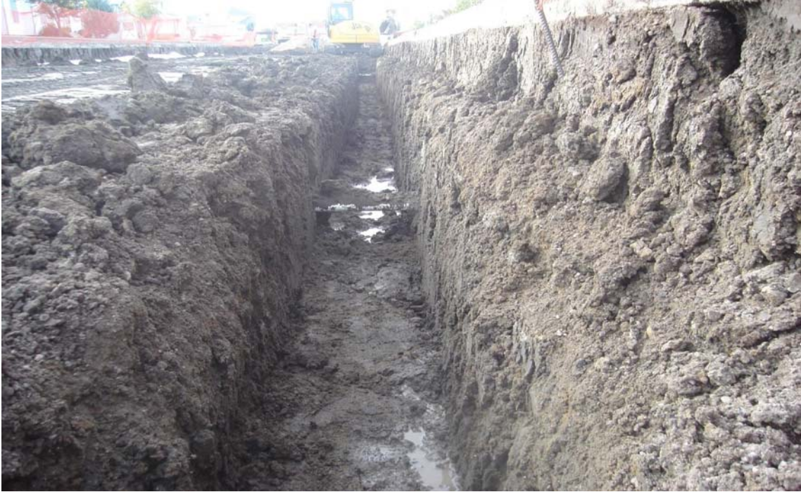
Figure 11 Sub-drain Excavation