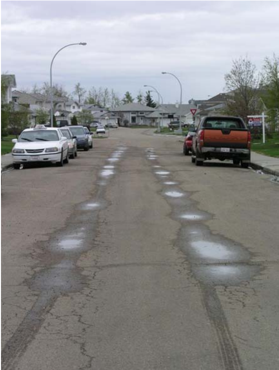
Figure 1 Settlement and water ponding in wheel path