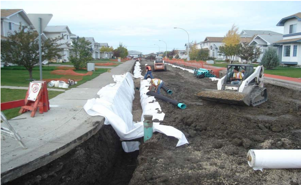
Figure 12 Sub-drain Installation