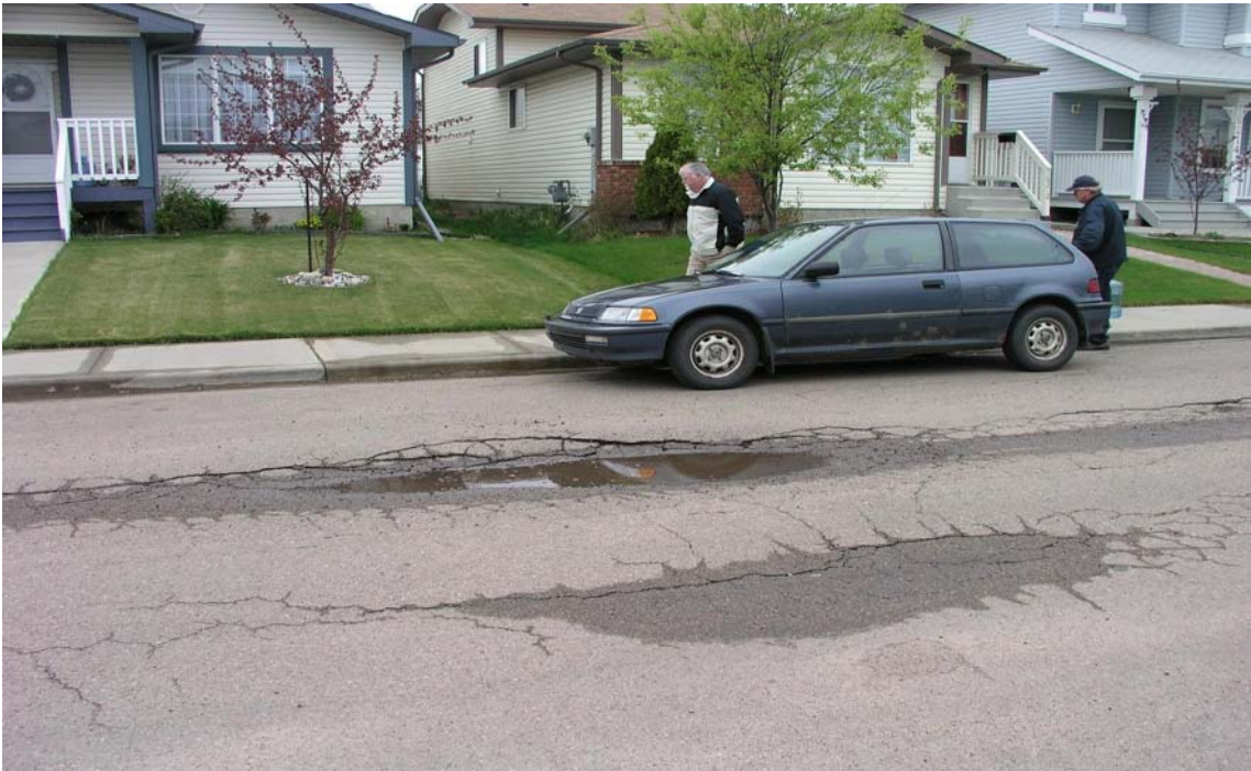
Figure 2 Settlement and water ponding in wheel path.