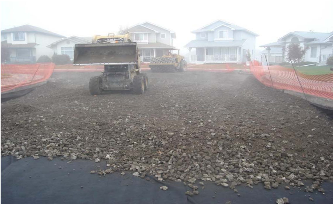
Figure 14 Granular Sub-base over Non-woven Geotextile