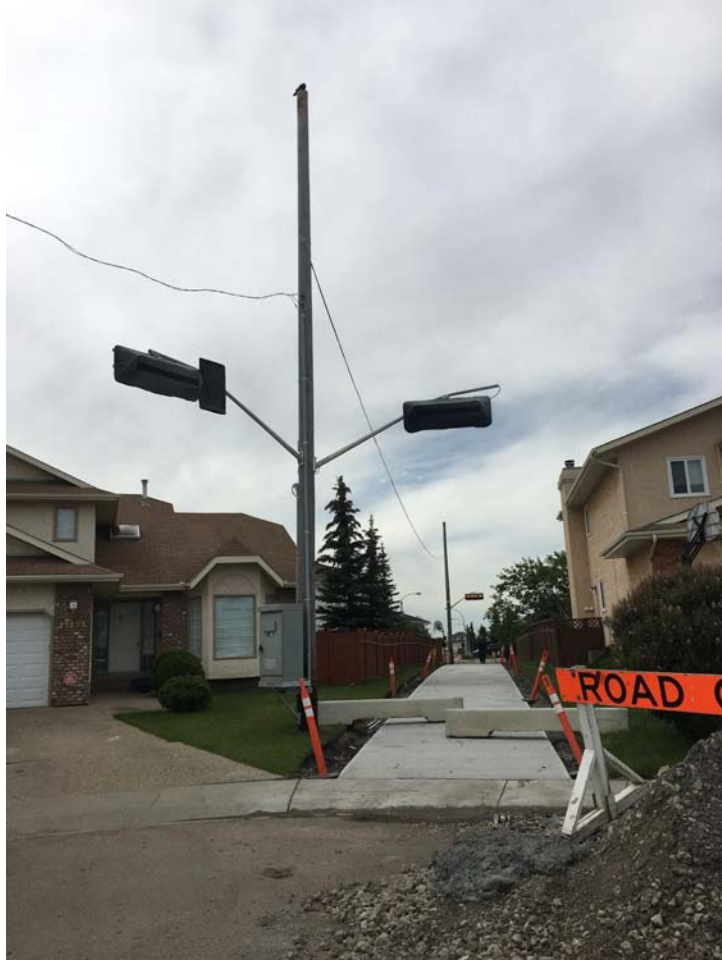
Figure 19 Temporary Signal for Access