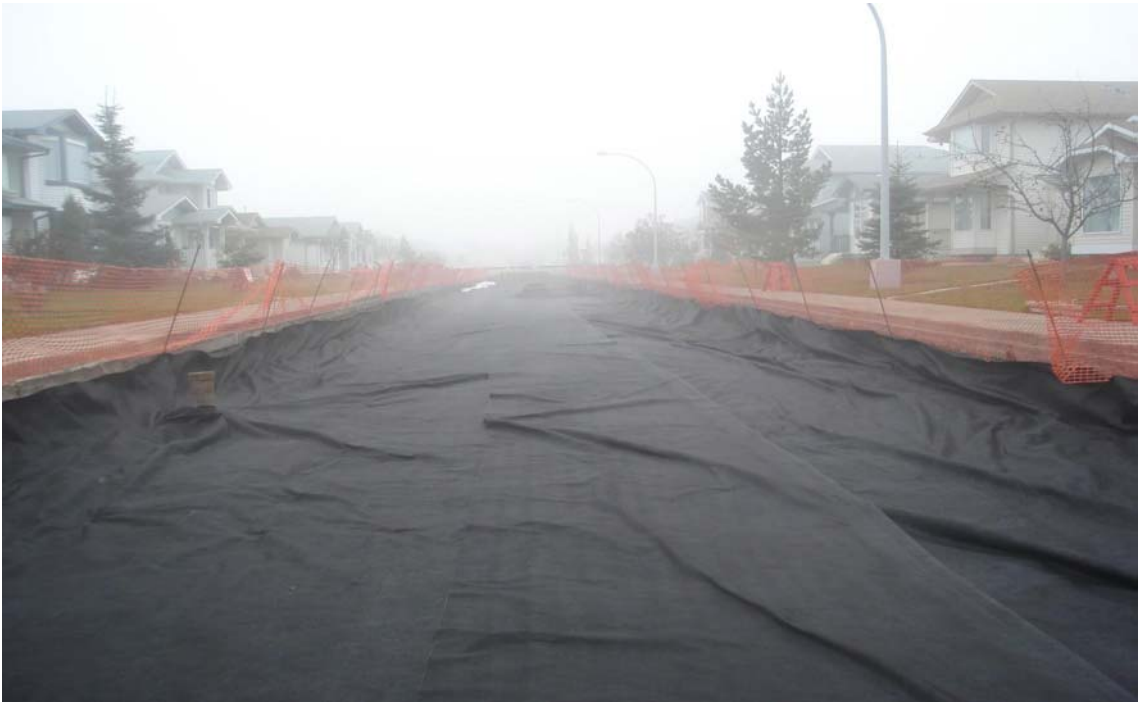
Figure 13 Installation Non-woven Geotextile