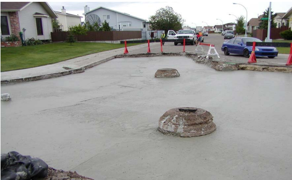
Figure 6 Cematrix Sub-base