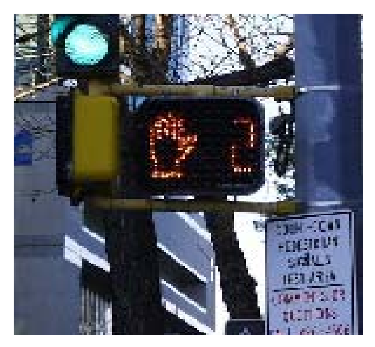
Figure 7 - Pedestrian Countdown Device

The City receives frequent complaints from pedestrians regarding short walk times at numerous crosswalks. Many of these calls are related to a misunderstanding of the pedestrian fixtures that operate with the walk man, flashing hand and solid hand. A common misconception is that the length of the walk phase should be timed in order to provide adequate time for a pedestrian to cross the entire width of a crosswalk. With the countdown devices in operation, pedestrians gain a better understanding of pedestrian timings. As the devices provide additional information and "peace of mind" to slow-moving pedestrians, they are particularly beneficial at intersections where the presence of seniors is relatively high.