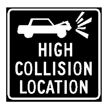
Figure 1 - High Collision Location Sign

Each year, the 20 intersection locations included in the program have High Collision Location signs installed (Figure 1). The signs are temporarily installed approximately 80 metres upstream of the approaches to each intersection for a period of one-year. In the past, these signs have been supplemented with a tab describing the predominant collision activity.