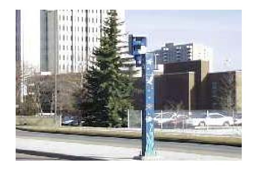
Figure 2 - Red Light Camera

Once a red light violation has been detected, the camera takes two photographs to show the motorist's illegal progression through the intersection. The first picture shows the vehicle entering the intersection during the red phase while the second picture shows the vehicle in the intersection approximately one second later. The system superimposes a data box on each photograph documenting the time, date and location of the violation as well as the amber and red times when the violation occurred.