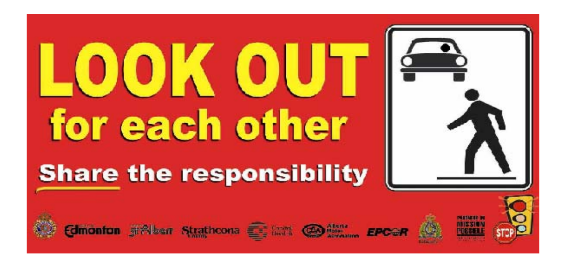
Figure 6 - Pedestrian Safety Campaign Sign

This regional partnership continued in 2003 to work towards building public awareness for red light running and pedestrian safety at intersections. In April 2003, an abbreviated version of the pedestrian safety campaign was conducted for a one-month period. This pedestrian safety initiative was followed by campaign in the fall of 2003, which addressed speeding at intersections. Currently an annual plan is being developed which will identify priorities for 2004 and 2005 along with an awareness plan which will detail traffic safety initiatives. This plan will include a budget along with campaign scheduling, program themes and potential co-ordination opportunities with other traffic safety initiatives in the region.