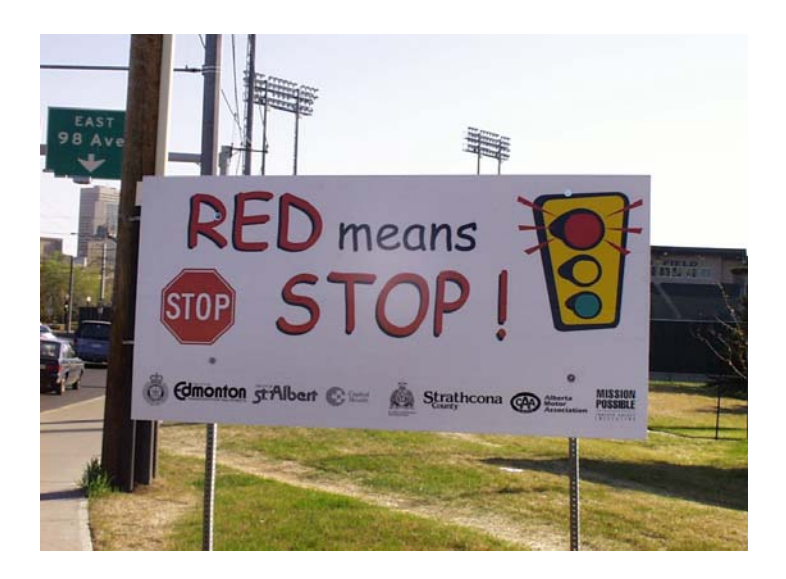
Figure 5 - "Red Means Stop!" Sign

In the spring of 2001, the group launched a "Red Means Stop!" (Figure 5) regional campaign to increase public awareness for the serious consequences of red light running. The campaign coincided with the addition of new red light camera locations within the Capital region. Over a two-month period, the public was reminded of the serious consequences associated with red light violations through the use of radio, newspaper, billboards, bridge banners and bus tails.