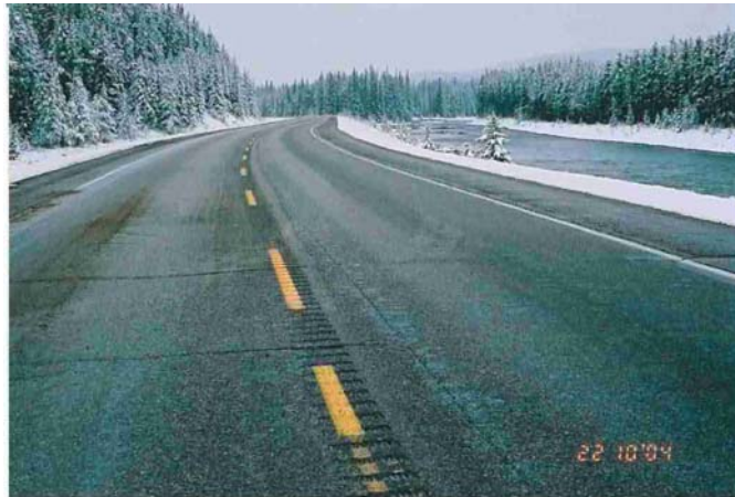
Figure 4: CLRS installed on the TransCanada Highway