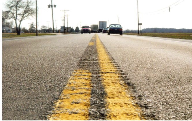
Figure 5: Centreline rumble strips in Delaware ( www.deldot.net/static/projects/rumblestrip/index.html )

The cross-sections of roads with CLRS vary from state to state. Recently, a survey was conducted focused on finding warrants for the installation of CLRS (5). The survey provides the following insight, based on eighteen responses: fourteen from U.S. states, and three Canadian provinces: