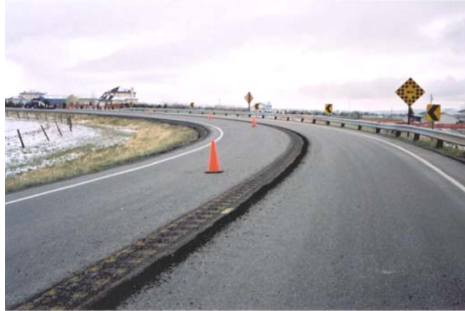
Figure 2: Milled centreline rumble strips in Alberta

In Alberta, CLRS are installed only in no passing zones on rural two-lane highways with a posted speed of 100 km/h (design speed of 110 km/h) (Figure 2). Locations are usually selected based on a pattern of collisions related to horizontal curvature and/or passing in a no passing zone (e.g., three or more related collisions in the last five years).