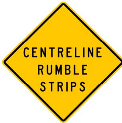
Figure 3: Temporary warning sign installed in Alberta