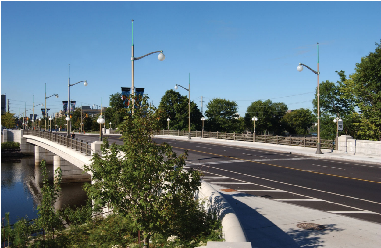
Figure 8 Bytown Bridges

That is not say that precast, pre-stressed concrete has no place in the urban context, or even on the Rideau River. In fact, it has been used in this century at the Bytown Bridges just above Rideau Falls, where it was desired that a minimalist, very low level structure be replaced by a new similarly low profile, low impact structure. Here, the road profile precluded many options and the desire to subdue the crossing rather than make it a feature was a design parameter. This arose from the fact that the bridge is nearby to the Prime Minister's residence and to Rideau Hall, the Governor General's residence, and was part of a contiguous ceremonial route on Sussex Drive. The bridge was subservient to these features and the focus was on the bridge roadway and sidewalk surfaces and ancillary features, not on the superstructure itself.