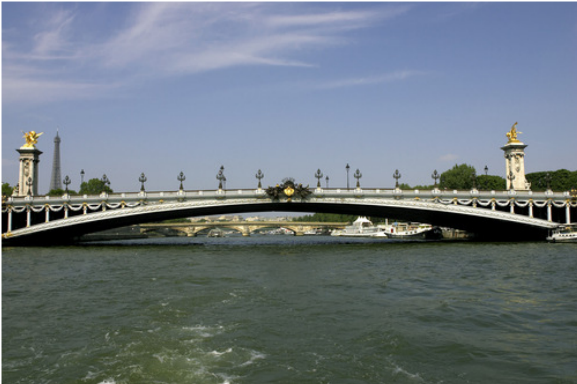
Figure 2 Pont Alexandre III in Paris

Another apparent constant throughout history is that bridge designers often made attempts to construct bridges which were not only durable, safe and practical, but which also had some element of beauty or aesthetic built into their fabric. Sometimes this arose as a result of a very clear application of engineering design principles, as in the case of the bridges of Robert Maillart in Switzerland, and sometimes it occurred as a combination of bridge engineering and decoration as in the case of the Pont Alexandre III in Paris. There are, of course, many exceptions where, for one reason or another, the bridge designers either did not try or were not allowed to incorporate aesthetic appeal into their bridges.