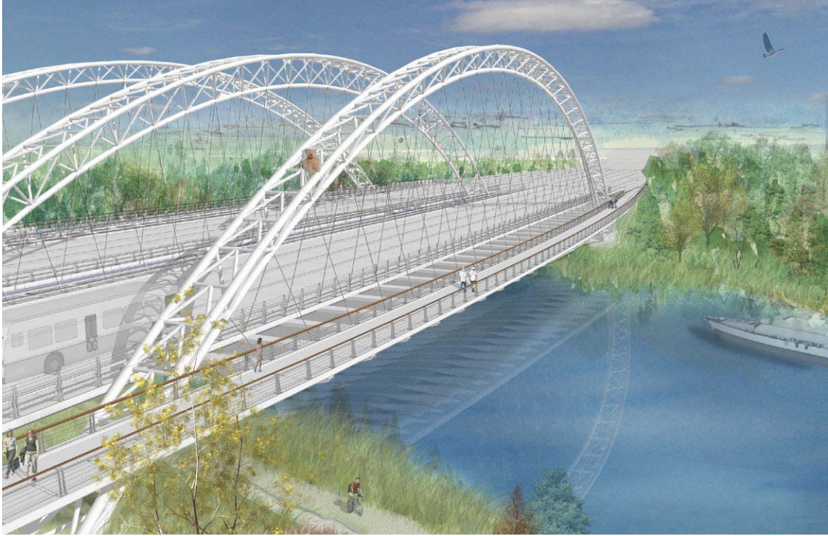
Figure 9 Strandherd Armstrong Bridge