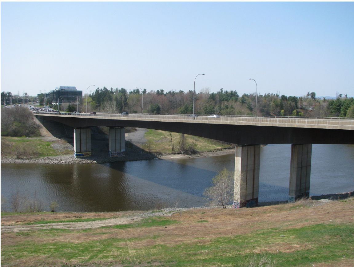
Figure 6 Hunt Club Bridge

The construction of the Hunt Club Bridge also made use of the waterway in an optimum fashion in that large steel sections were brought to the site by water from Montreal, through the lock system on the Rideau Canal, and then lifted into position at the bridge site. This is in contrast to the St. Patrick Street Bridge, where the water was a considerable difficulty for construction of both substructures and superstructure. Hunt Club Bridge is derived from conventional highway bridge technology but it was carefully thought through in order to fit well with the site, and with pleasing aesthetics overall given its considerable scale and substantial depth of construction.