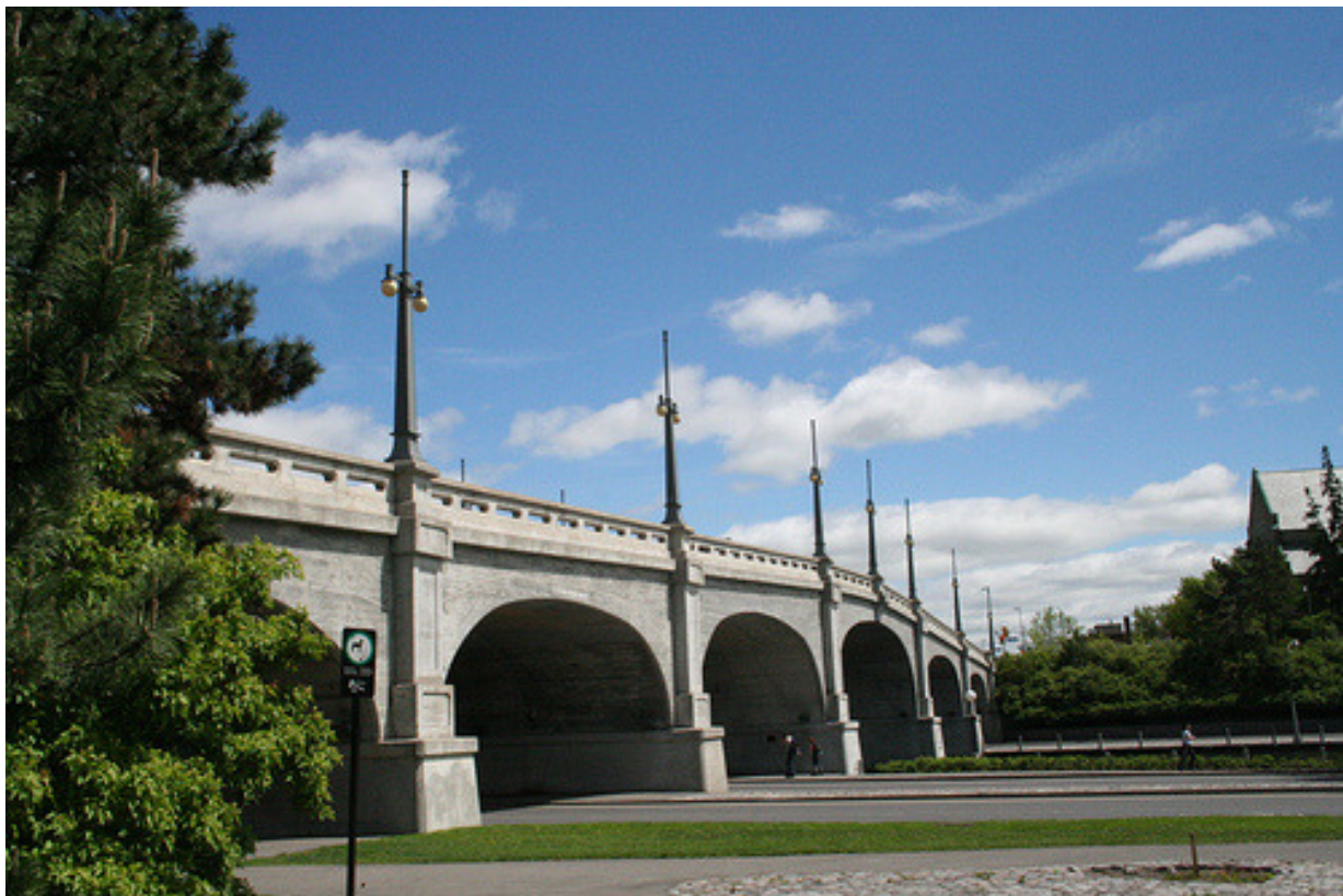
Figure 3 Bank Street Bridge

The recently evolving climate of bridge engineering design and construction can be illustrated by reference to this suite of historical and modern bridge projects.