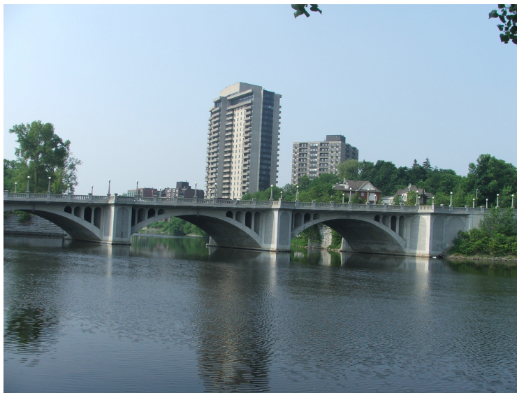
Figure 7 Cummings Bridge

Similar considerations led to the 1990s rehabilitation of the Cummings Bridge, a reinforced concrete spandrel arch. Very little of the original structure was, in fact, retained during the rehabilitation as a result of the very poor condition of the bridge, but the arches remain in service and the bridge, as reconstructed, restored this fundamentally elegant bridge crossing to its original appearance. Considerable efforts were made with such features as handrails and lighting to ensure a thoughtful restoration. One can imagine the tremendous difference had, for example, a precast concrete girder bridge been constructed at this site. No doubt, such a precast concrete girder bridge would have been less expensive in terms of capital cost, but it would have been much more expensive in terms of social and cultural effect as a very negative and brutal intrusion upon the urban landscape. In the past 40 years, such intrusions have become virtually unthinkable, fortunately.