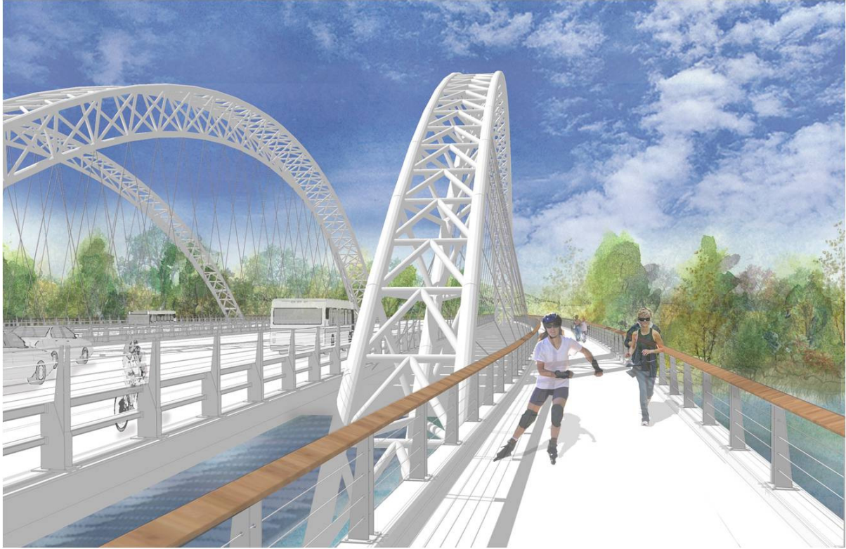
Figure 11 Strandherd Armstrong Bridge