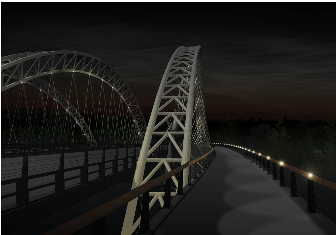
Figure 14 Strandherd Armstrong Bridge at night