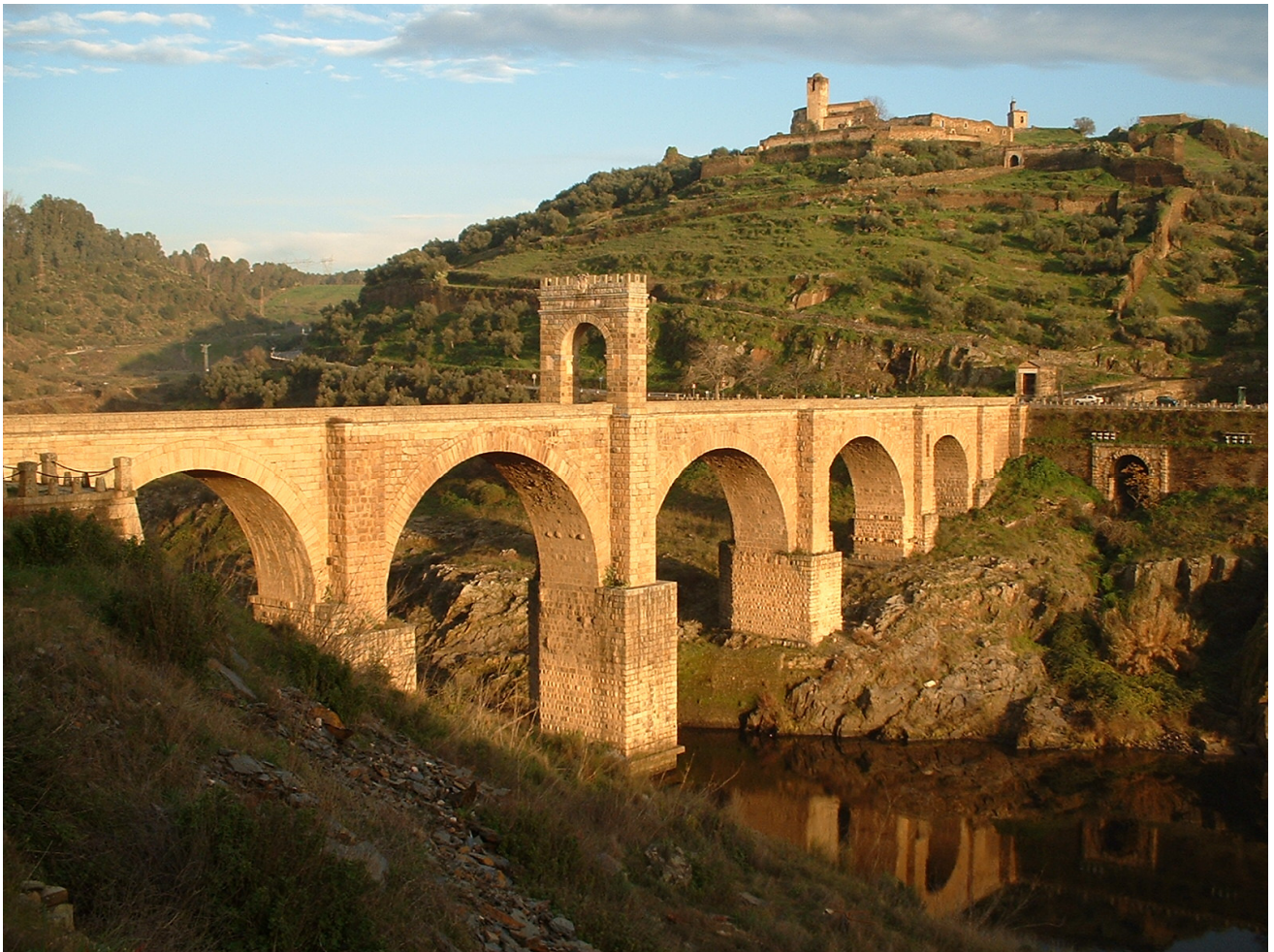
Figure 1 Alcántara Bridge over the Tagus River

Bridge engineering has a long and honourable history dating back to such landmark structures as the Anui Arch Bridge in China (also known as the Zhaozhou Bridge), which was constructed in 591 to 599 AD, and the Alcántara over the Tagus River in Spain constructed by the Romans in 104 to 106 AD. These bridges remain in service today as a testimony to the skills of the designers and builders, and to their mastery of the art and science of bridge engineering design and construction. These bridges also have considerable and well-recognized merit from artistic and aesthetic perspectives and they can, we believe, be considered to add positively to the environments in which they are found. They are, in fact, the most interesting and noteworthy elements of those environments. We will return to this idea at the end of this paper.