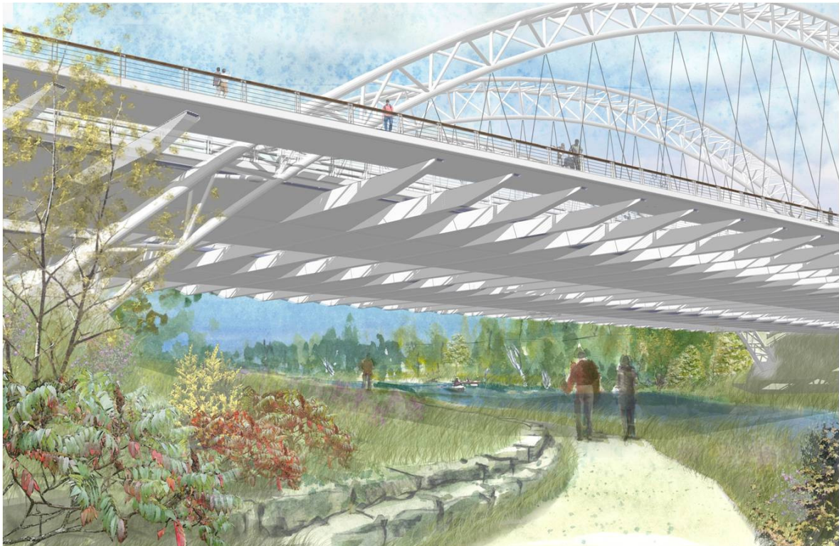
Figure 10 Strandherd Armstrong Bridge