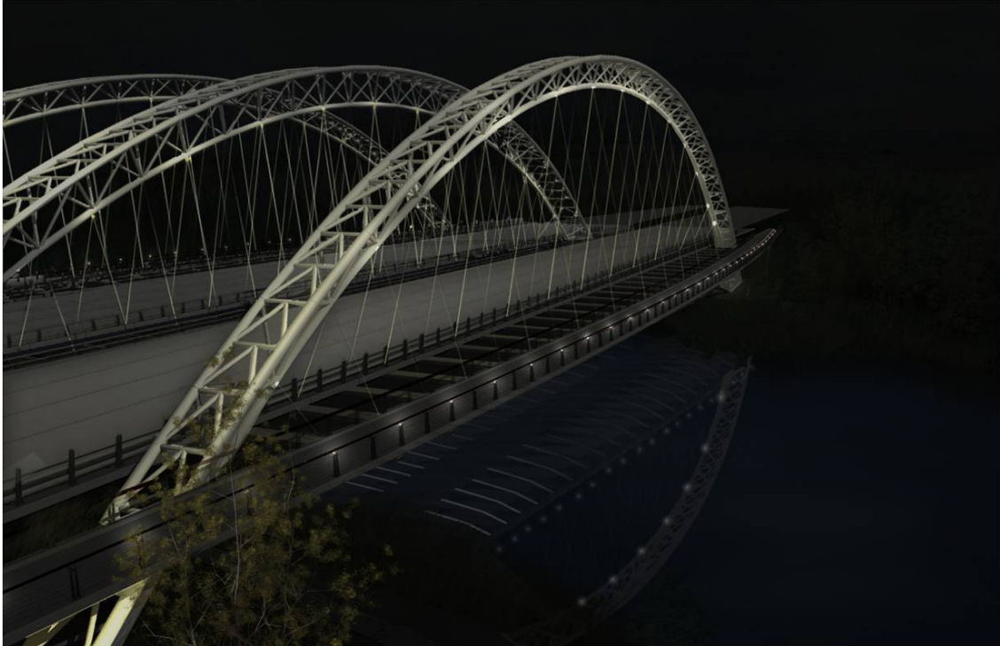
Figure 13 Strandherd Armstrong Bridge at night