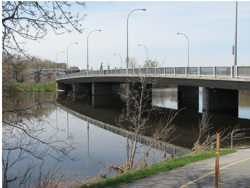
Figure 4 St. Patrick Street Bridge

Steel box girders and post-tensioned concrete slab bridges were ultimately short-listed, with the post-tensioned concrete bridge being selected by the owner for implementation. This created a bridge design which required a very significant intrusion into the Rideau River to enable not only the construction of the piers, but also the supporting of the concrete deck on falsework. While the effect on the hydraulics of the river was an obvious consideration, issues such as fish habitat were not at that time, and the bridge was constructed by the use of earth cofferdams, and such measures as falsework supported on timber on the riverbed. While this created some adventures during construction, and included some risks which had to be carefully controlled, the bridge proved to be constructible and it has served well for more than 30 years. It seems likely, however, that no such bridge will be built in the Rideau River again.