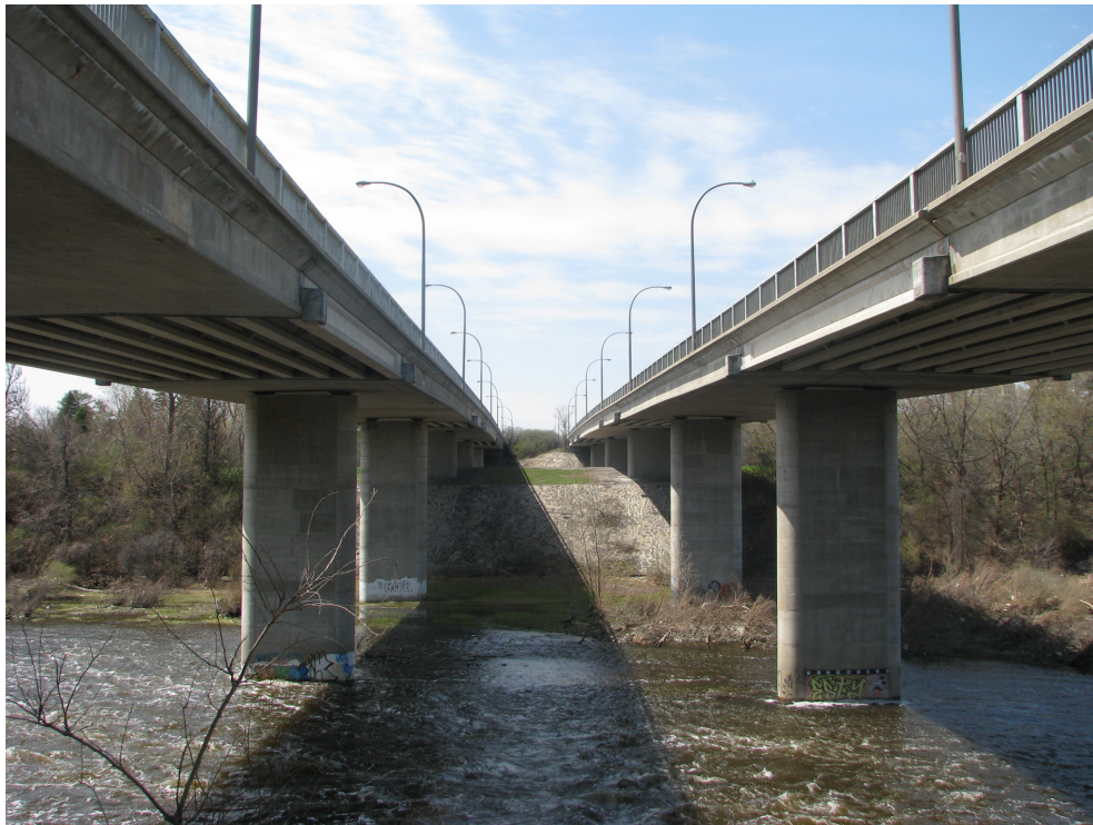
Figure 5 Heron Road Bridge

This bridge, like St Patrick Street Bridge, reflected the ethos of the time as to bridge selection, namely an interest in aesthetics tempered by an emphasis on modernity as then perceived, as reflected in fairly sleek, linear, smooth, unadorned and rather conservative designs. Ideas such as the use of arches, while considered at some length, were ultimately set aside for more simple linear structural forms. As well, environmental considerations (such as fish habitat and spawning, tree conservation and the like) were not considered explicitly, and the effects on the social and cultural environment were not given high priority.